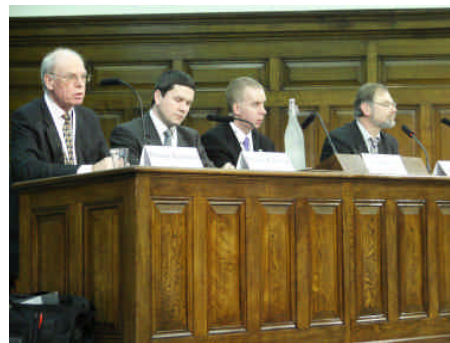
A Panel Discussion